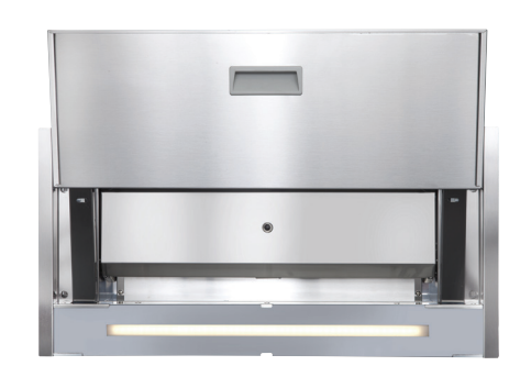
Pictured: VAPORE - 60cm under side open