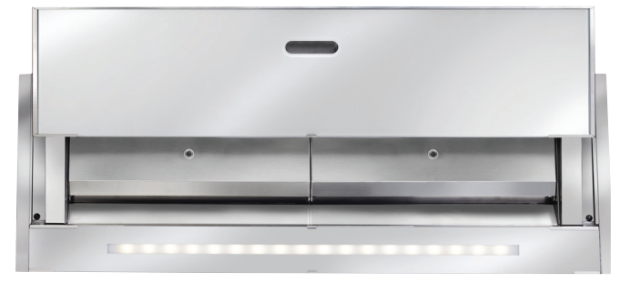
Pictured: VAPORE - 90cm under side open