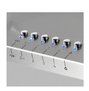
Pictured: VAPORE control panel

From now on every induction hob has found its solution: VAPORE!