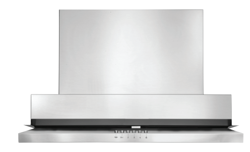
Pictured: VAPORE - 60cm induction hood