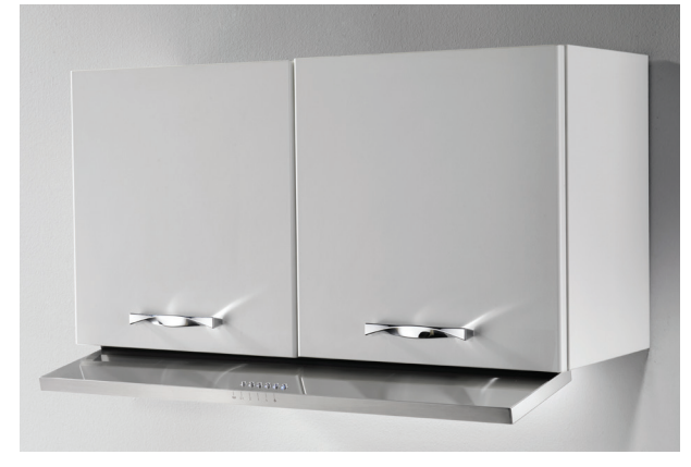
Pictured: VAPORE - 90cm Induction Hood