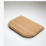
AC15 Bamboo Board