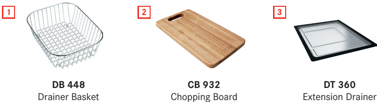
DB 448 Drainer Basket