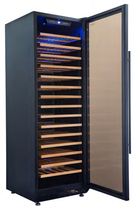
Black Trim Shown