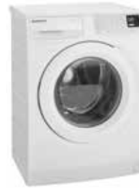
SWF7025EQWA EZI set