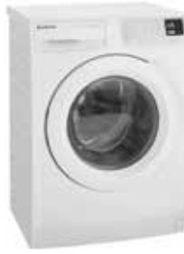
SWF8025DQWA EZI set