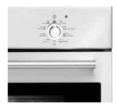
Laser etched cooking modes on control panel with symbol & words