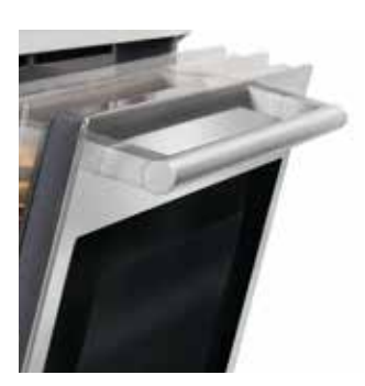
S-move soft & gentle closing door hinges

The new size of the cooking cavity provides more cooking space and maximises the full internal size of the oven. Our new ULTRA-Clean light grey, nickel-free enamel interior reduces the toxicity of materials in contact with foods and is easy to clean. Another new feature is the S-MOVE soft-closing door allows you to gently close the oven door with a simple push, preventing door impact; without using your hands, which are free to perform other tasks. Standard in the oven are Telescopic racks and are totally removable making the use of the ovens baking trays and general cooking in the oven easy and effortless. The Full size inner door glass provides a panoramic view from the outside of the oven door of what is inside the oven, its fill width also enables easy cleaning with no crevices for food scraps and residue to get trapped.