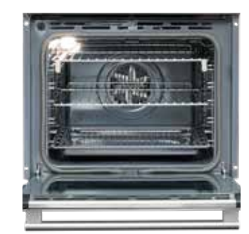
ULTRA-Clean smooth grey cavity