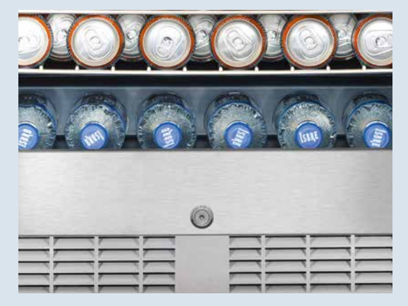
Integrated lock: Integrated in the door below the glass, this sturdy lock provides protection from unwanted entry.