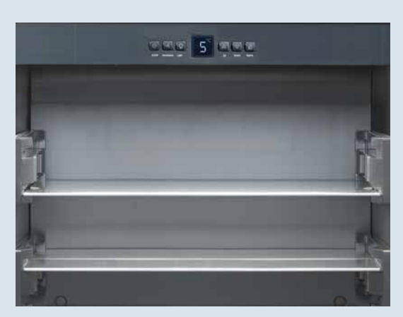
Sectionable glass shelf: The middle glass shelf is sectioned so that the front half can slide under the other to provide room for taller beverages or food items.

Telescopic shelf: The telescopic wire shelf makes it easy to access drinks located at the rear of the shelf, so all valuable space can be utilised efficiently.