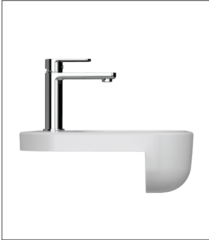
Tapware shown not included.

Classic and relaxed. The subtle, subdued curves of Luna basins will effortlessly flow into any contemporary bathroom design. This basin is suitable for domestic and commercial applications.