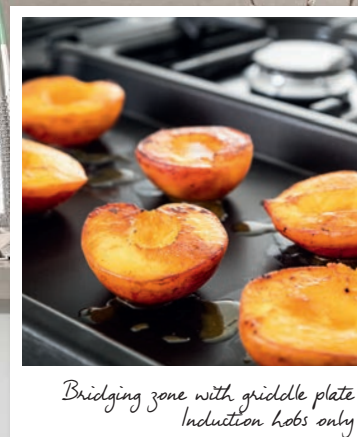
Bridging zone with griddle plate Induction hobs only