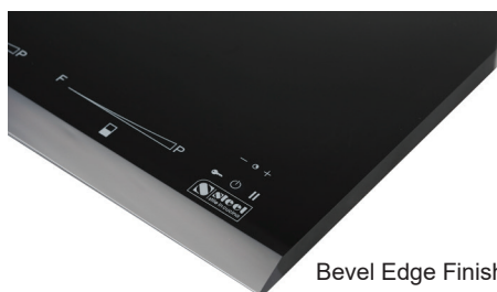
Bevel Edge Finish